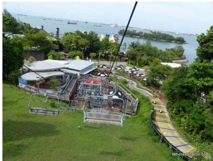
View from chair lift

Of the smaller attractions on Sentosa Island, this was our favourite. It's quick but lots of fun!