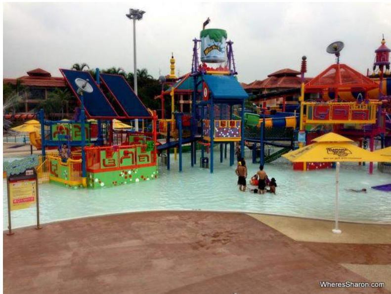
Wild Wild Wet

A better budget option if you want to cool down compared to the big water park on Sentosa Island is Wild Wild Wet, located near the end of the train line at Pasir Ris.