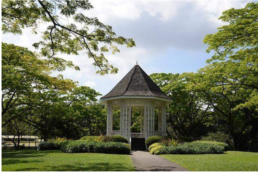
Singapore Botanic Gardens

The Singapore Botanic Gardens is a UNESCO World Heritage Site and a great place to have a run around and relax while learning more in a beautiful setting.