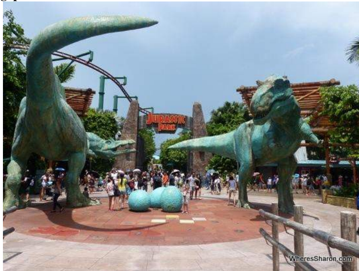
The Lost World zone

Universal Studios Singapore is the big ticket attraction on Sentosa Island and at the top of the list of our favourite things to do with family in Singapore. We had such a great time here.