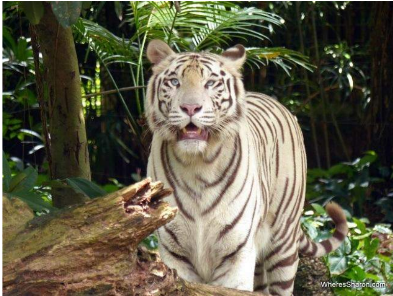
Amazing white tiger at Singapore Zoo