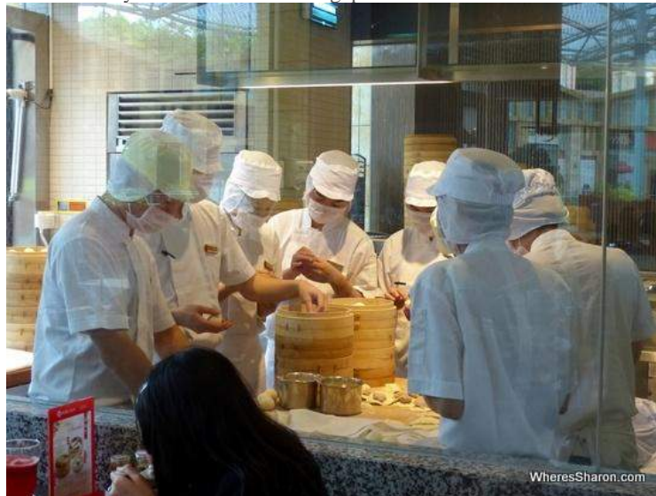
The dumpling masters work their magic at Din Tai Fung