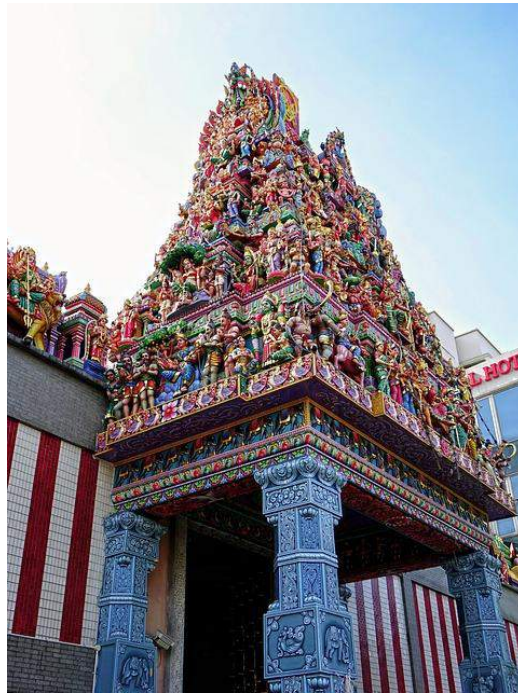
Sri Veeramakaliamman Temple

There are many temples in Little India and the most colourful and bustling is Sri Veeramakaliamman Temple. This is one of the kid friendly places in Singapore and a great way for the kids to experience something different.