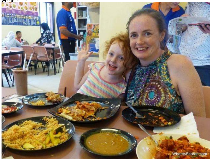
Eating a feast in Singapore's self proclaimed best Muslim restaurant, Zam Zam

There is some fabulous food in Singapore and I always make it a goal to eat some fabulous Malay, Chinese and Indian food (the three main cultures) every visit. The easiest way to do this is to go to each of the main Malay, Chinese and Indian areas (all talked about above!) and eat out.