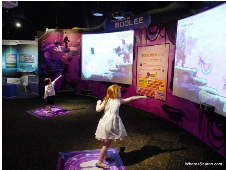
Competition time at Singapore Science Centre

This big science museum has plenty to keep the kids entertained and educated. There are many rooms and areas and it seemingly goes on and on – we were there 4 hours and saw just over half – and it felt like we raced through!