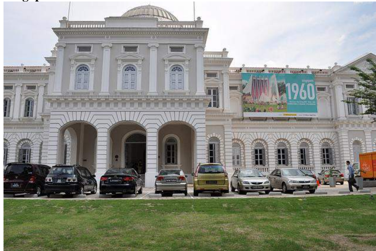
National Museum of Singapore.

The National Museum of Singapore is an excellent attraction to add to your list of things to do with children in Singapore. Its lively, interactive and works well with kids and also has lots to teach all members of the family. The building itself is also beautiful.