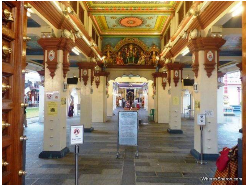
Sri Mariamman Temple

Sri Mariamman Temple is Singapore's oldest Hindu Temple and was originally built in 1823 before being rebuilt in 1843. It's surrounded by Chinatown markets which makes it extra easy to visit.