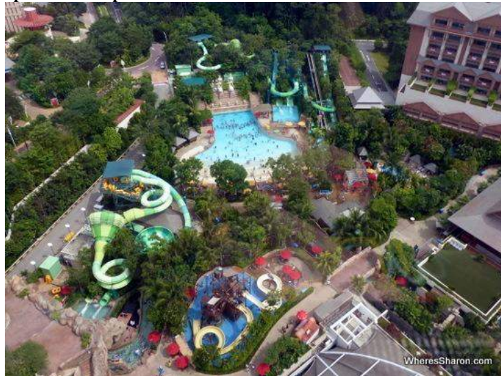
Adventure Cove Waterpark from the cable car

Adventure Cove Waterpark is a fun water park located in the Resorts World Sentosa part of Sentosa Island with water slides, wave pool, kid water play areas, a water based obstacle course, snorkeling with fish over a reef and a river to tube around.