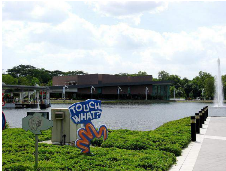
Singapore Discovery Centre.

One of the kids friendly places in Singapore on the list for our last visit was the Singapore Discover Centre.