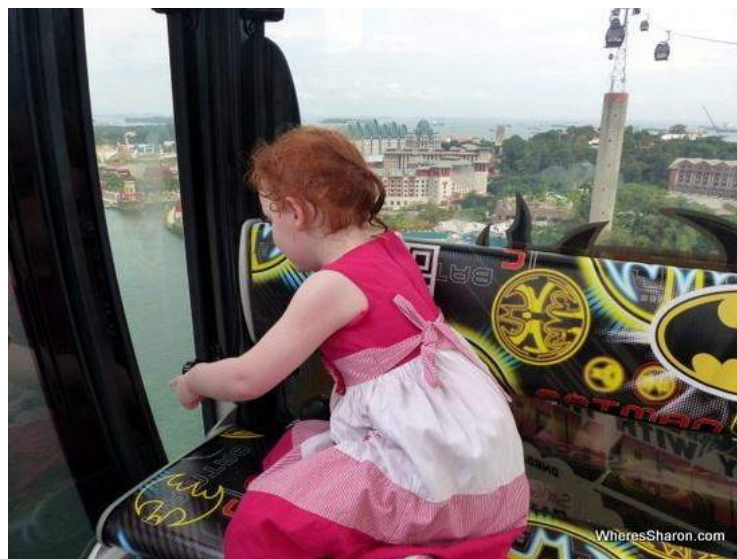
Sentosa from the cable car

One of the best ways to start your Singapore family activities on Sentosa is with a cable car ride over to the island. It's quick, easy, there's great views and you really should do it at least once. Find discounted tickets here .