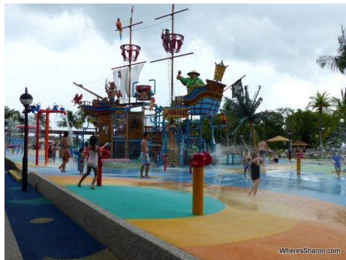
Port of Lost Wonder

For younger kids, this is another of our favourite Singapore kids' activities. Port of Lost Wonder is basically a big, outdoor play centre and our 4 year old loved it.