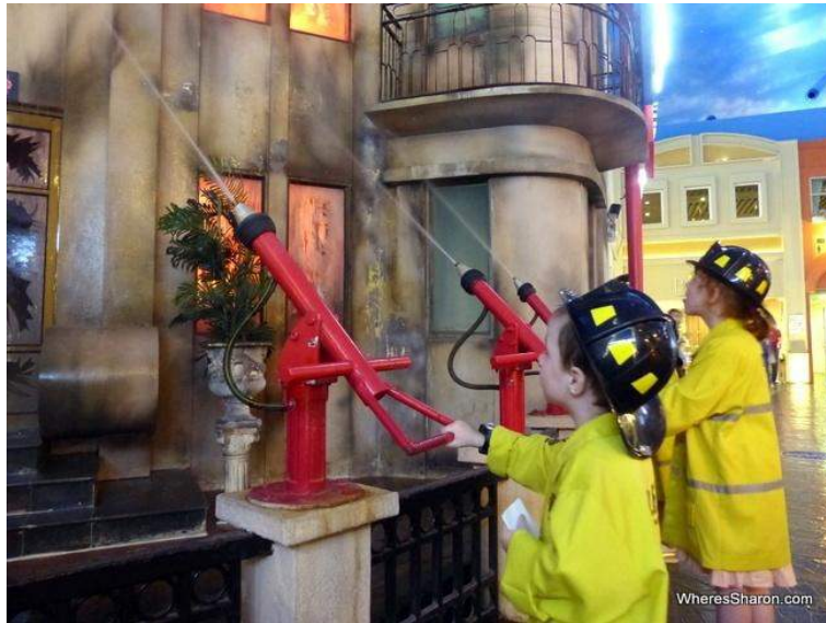
Putting out the fire at KidZania Bangkok

KidZania Singapore is due to open in April 2016, so we haven't been yet. However, we love KidZanias!! We have visited three so far and they are all very similar.