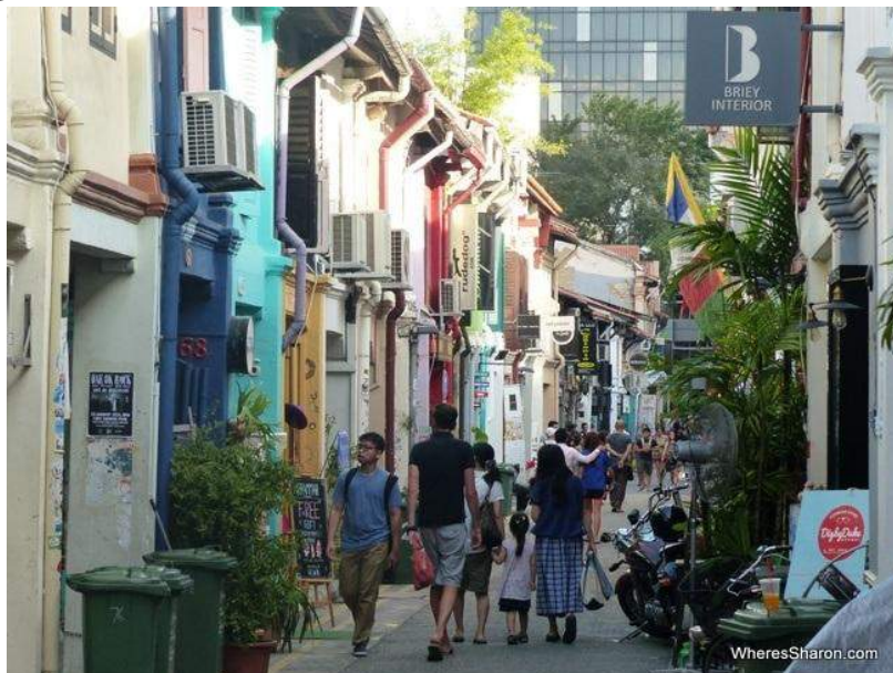
Kampong Glam is a great area to explore – this is a street right behind our hotel

Kampong Glam is Singapore's traditional Muslim area and historic seat of the Malay royalty with beautiful low rise buildings, mosques, shops and great eating options. It's very easy to access from MRT Bugis.