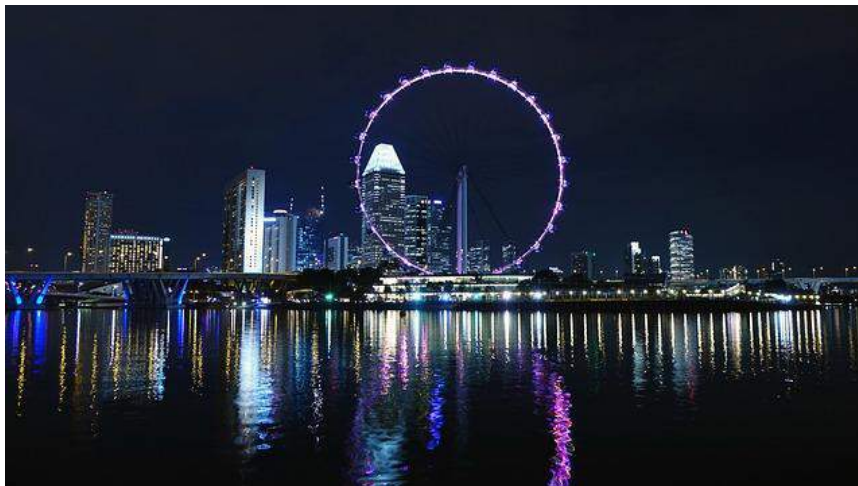
The Singapore Flyer at night

A great introduction and one of our things to do in Singapore with family is to take a ride on the big Singapore flyer – the second largest observation wheel in the world.