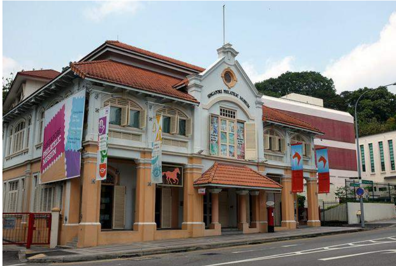
Singapore Philatelic Museum

This museum is full of Singapore stamps and related items but it is much more than a stamp museum. It manages to tell the history of Singapore through stamps and interesting displays and has been designed with kids in mind making this one of the fun places for kids in Singapore