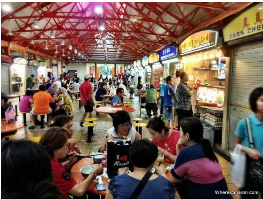
Maxwell Road Food Center – there are some good places to eat in Chinatown