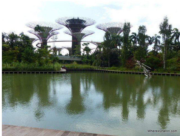
The Supertrees and OCBC Skyway

One of my absolute favourite things to do in Singapore is to visit Gardens by the Bay. This place is amazing and it is like visiting a futuristic garden with its vertical gardens (“Supertrees”!), big domed conservatories and very cool children’s garden.