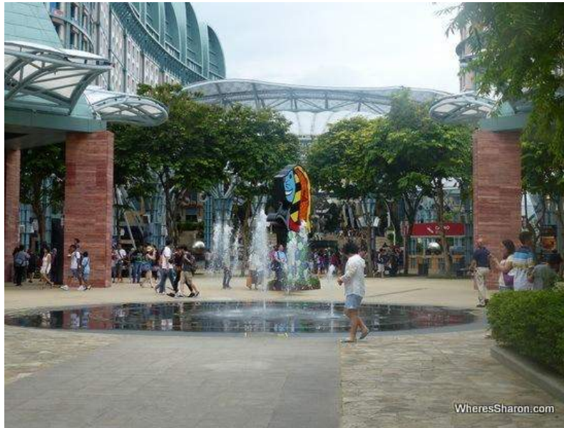
Resorts World Sentosa

Resorts World Sentosa is an area that takes up a big chunk of Sentosa Island. This is where you will find the biggest places to visit in Singapore for families – Universal Studios Singapore, S.E.A Aquarium, Dolphin Island and Adventure Cove Waterpark (more about these attractions below). It would be easy to visit Sentosa Island and only come to this section of the island.