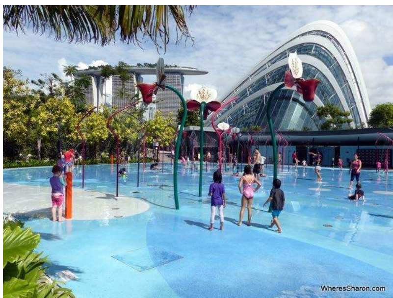
Far East Organization Children's Garden water playground with the Cloud Forest behind

Another must visit is the OCBC Skyway among the Supertrees – which look like giant futuristic trees but are actually vertical garden displays. You can walk around these at 22 metres high. It would be cool to do this at night with older kids as they are all lit up and there are light and sound shows! I took Mr 3 here as he wanted to do it but freaked out at the last moment.