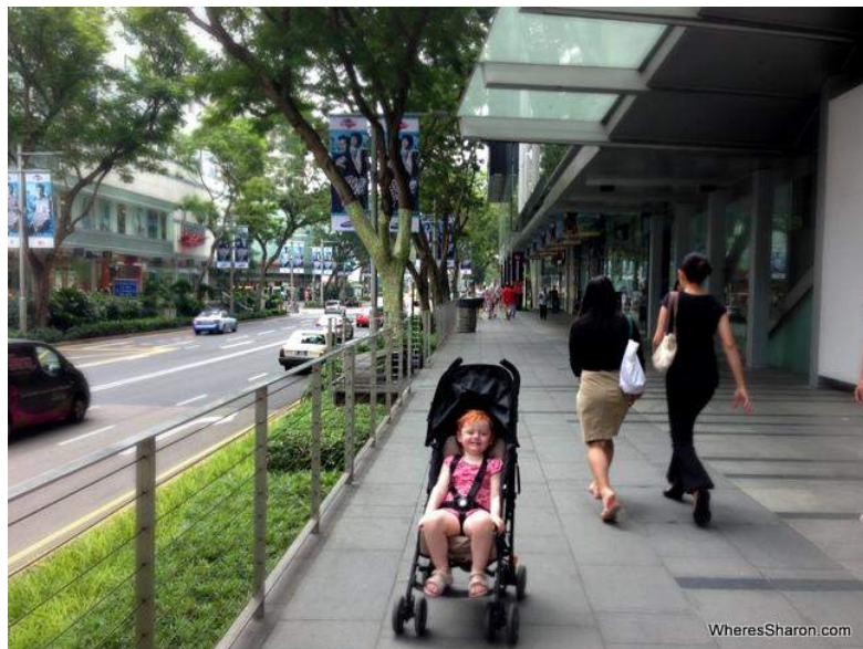
Exploring Orchard Road with a 2yo S

This famous shopping strip is a great place to head if you want to do some shopping. Massive shopping centres line the street and there are also other activities, like many cinemas.