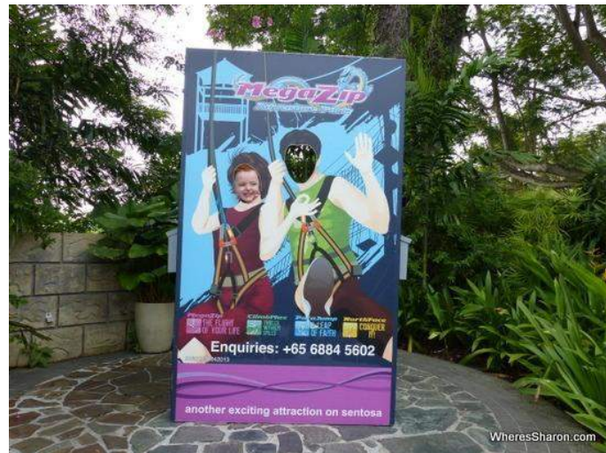
What S would look like on the MegaZip

This is a 75 metre high, 450 metres long zipline over the jungle and down to the beach. There are also aerial rope courses and a free fall simulator. You can buy discounted tickets here .