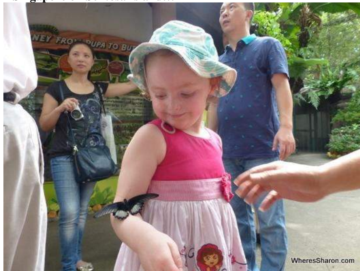
S loved the butterflies at the Butterfly Park and Insect Kingdom

There are sooooo many other things to do on Sentosa Island as well ( read more in the dedicated guide):