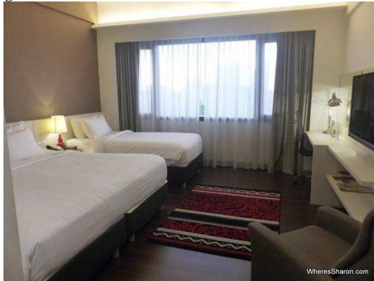
Our family room

This hotel is in a fabulous location – close to MRT Bugis which is on two great train lines, in Kampong Glam and very close to Little India. We found it very easy to go everywhere we wanted to go from here.