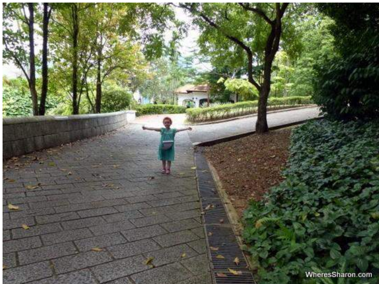
Fort Canning, just behind the Hotel Fort Canning

Fort Canning Park is a lovely, big green area in the middle of the city. There are some low key attractions here as well as a fabulous hotel (more about that below).