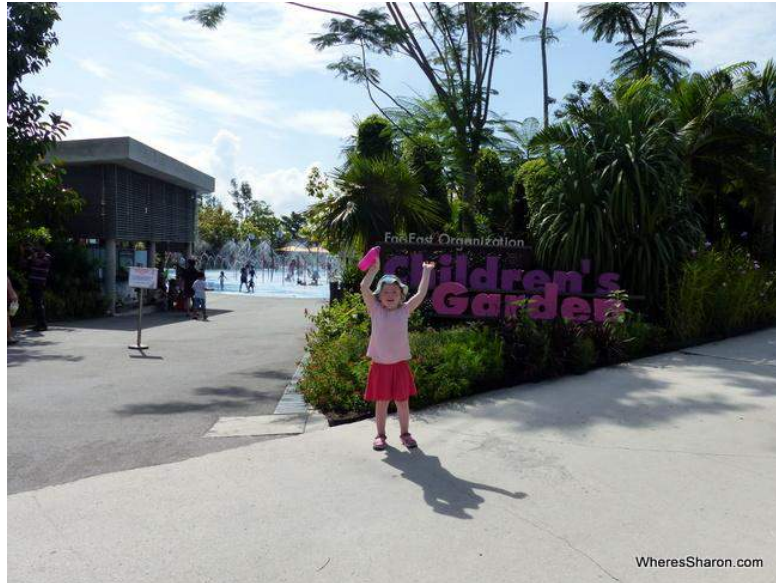
Gardens by the Bay is one of my favourite places in Singapore and mostly free

Thanks to the MRT system, it can be economical to get around. However, once you need to buy tickets for your kids, it does start to add up and taxis can actually become cheaper for shorter distances so this is something to keep in mind.