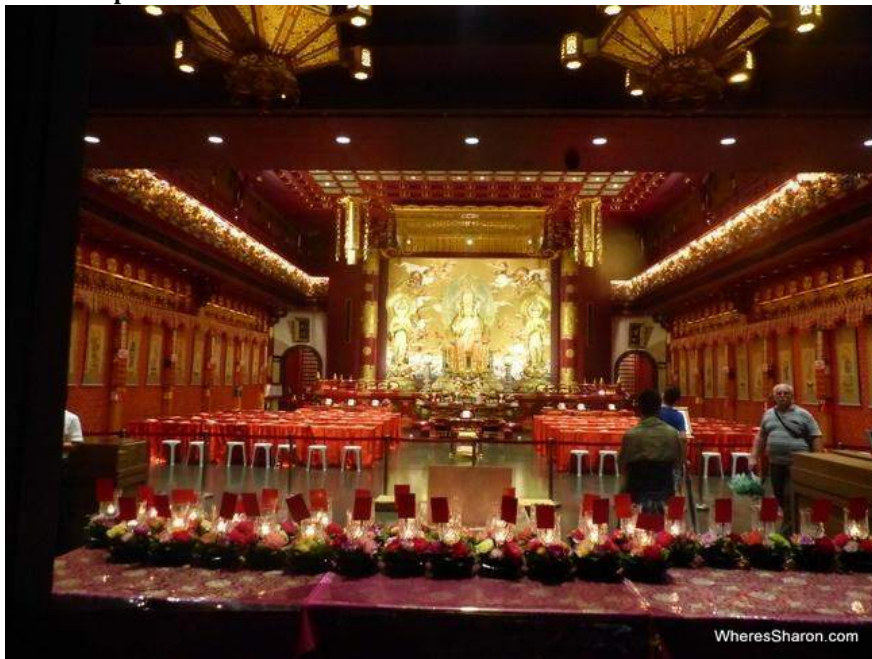
Buddha Tooth Relic Temple

This five storey temple in Chinatown is home to what is supposedly Buddha's left canine tooth. It's also a richly decorated temple which is well worth a visit for the whole family. In addition to the tooth, there is also a third floor museum of religious relics and a lovely rooftop garden with a big prayer wheel and ten thousand buddhas in a pagoda.