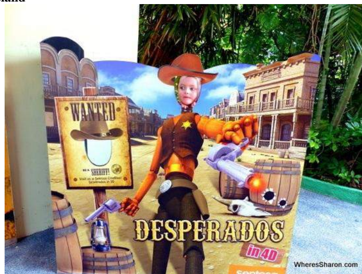
What S would like like if she went on this ride

Sentosa 4D Adventureland consists of a 4D movie, 4D roller coaster and a 4D interactive shooting game. They are fun, but better suited to older kids.