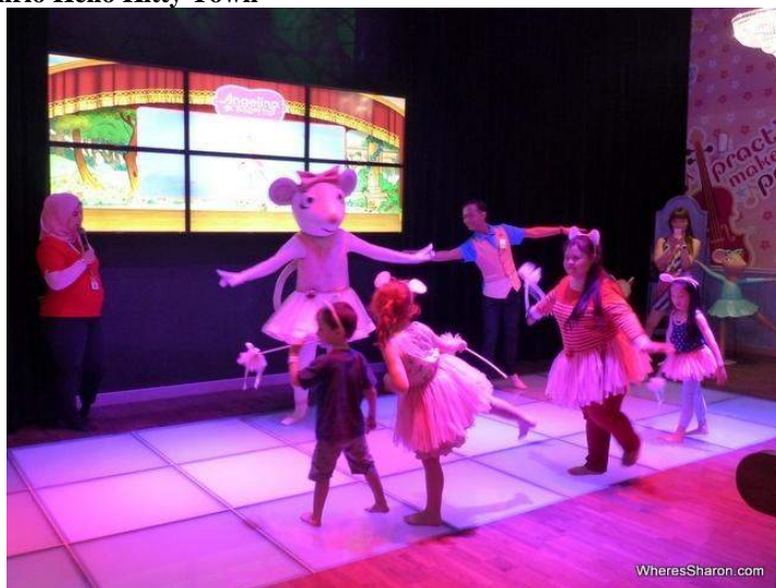
A dance class with Angelina Ballerina herself!

This indoor theme park about 5 minutes drive from Legoland Malaysia is two theme parks in one – on one level is Sanrio Hello Kitty Town which is all about Hello Kitty, and on another two levels is Thomas Town which is all about Thomas the Tank Engine and friends, Angelina Ballerina, Bob the Builder, Pingu and Barney.