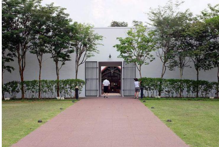
Changi Museum and Chapel

This museum is dedicated to the POW camps at Changi during World War II and the Japanese occupation. The chapel museum has a recreation of two of the chapels in the different PoW camps around Changi. As part of a recreation of St. Luke's Chapel, they have the famous murals painted by one of the prisoners.