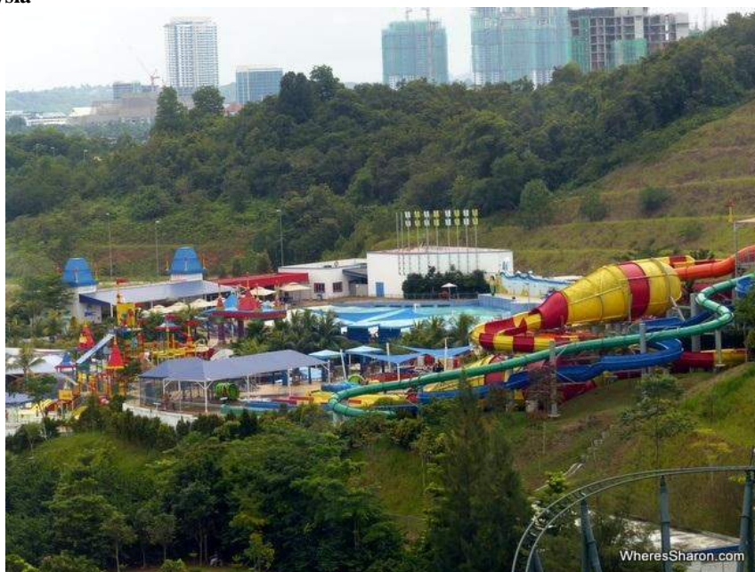
Legoland Water Park from the big observation tower at Legoland

The biggest reason families head over the causeway on a family trip to Singapore has to be this big theme park located in the Johor Bahru area. It is well worth the trip.