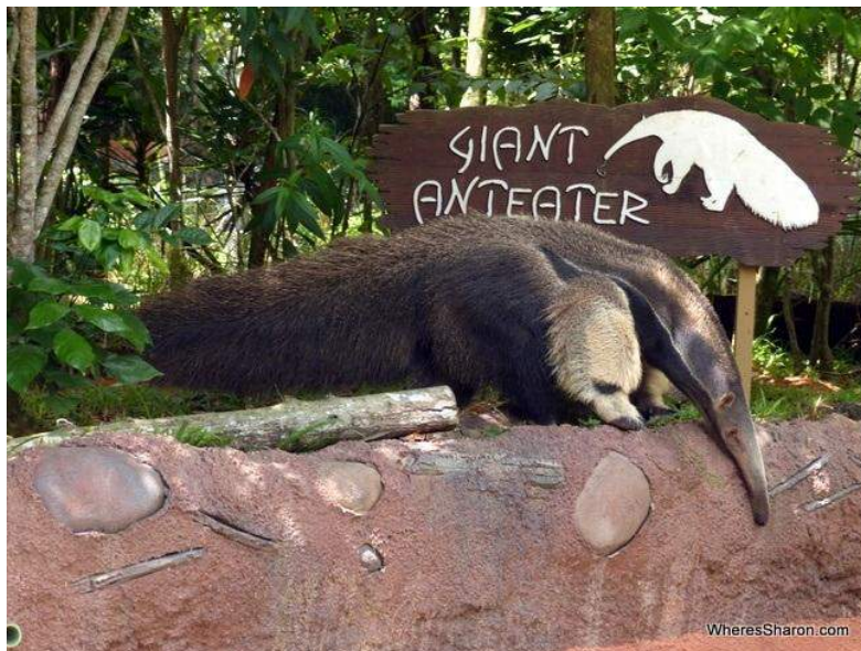
Views from the River Safari