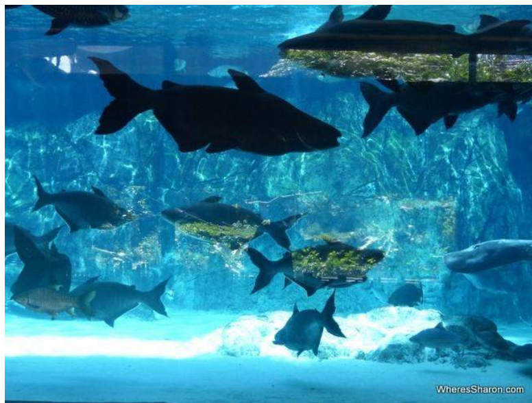
We loved the River Safari

Unlike a zoo where you wander around as you like, the River Safari has one long path that guides you around everything (some things you can cut out). This is a good thing as tanks and enclosures are well spaced out.