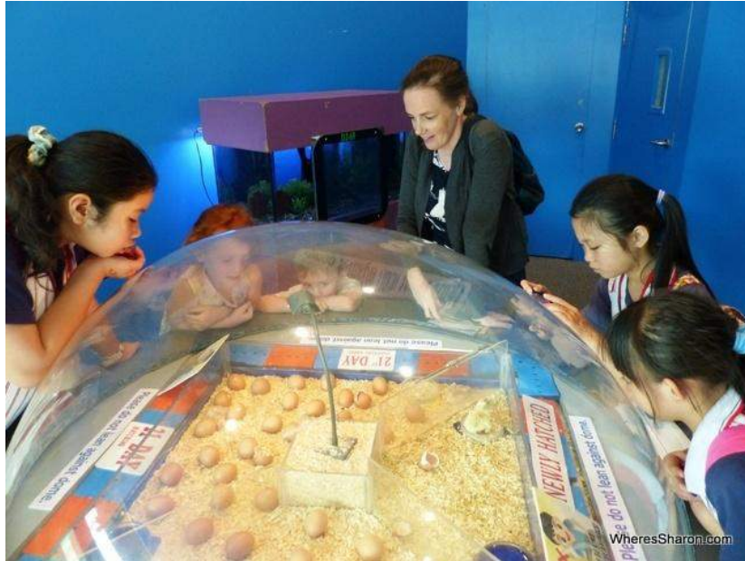
Watching chicks hatch!

Our kids did love it, so this wasn't a problem at all. I just think older kids would get more out of it. I was teaching year 7 and 8 science back in Australia and there were many things in there that would have been perfect for them.