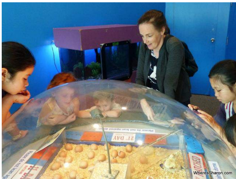
Watching chicks hatch at the Singapore Science Centre

We love love love Singapore, especially with kids.