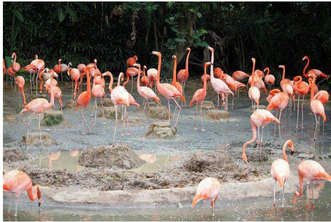
Flamingos at Jurong Bird Park

Jurong Bird Park is Asia's largest bird park with over 5000 birds! It's another option of family day activities in Singapore.