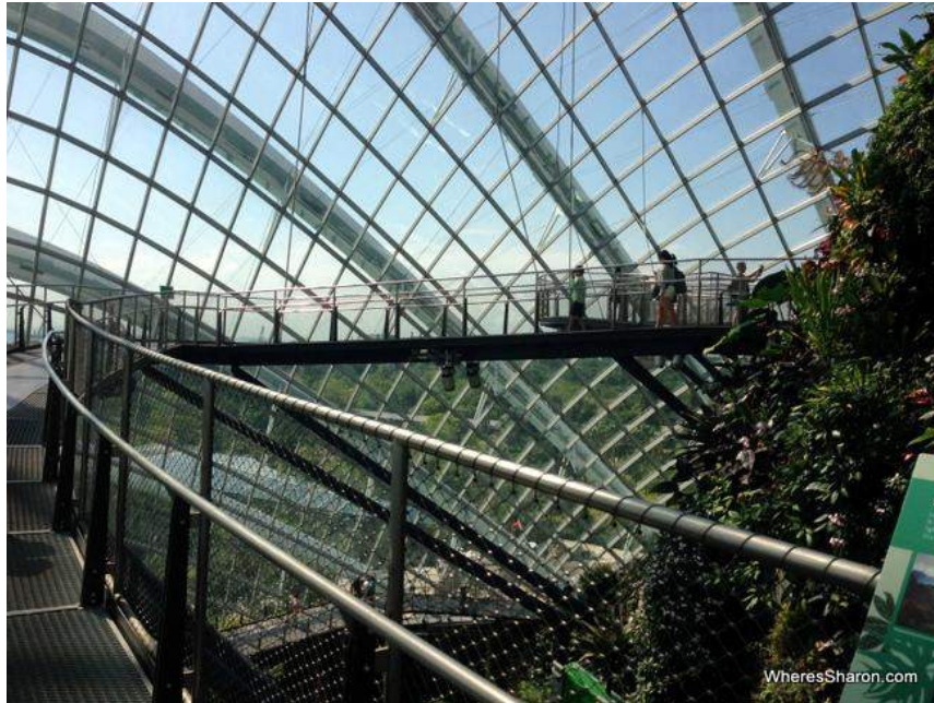
Inside the Cloud Forest dome

It was amazing. It's a big dome featuring a 35 metre tall "mountain" complete with waterfall. There are many different levels with a lift to the top one and then we slowly made our way down. There are cool pathways that were suspended in the air at times. It features plant life from tropical highland areas up to 2000m above sea level. As a bonus, it's nice and cool compared to the outside air. Mr 3 walked around saying a lot of "wow"s!